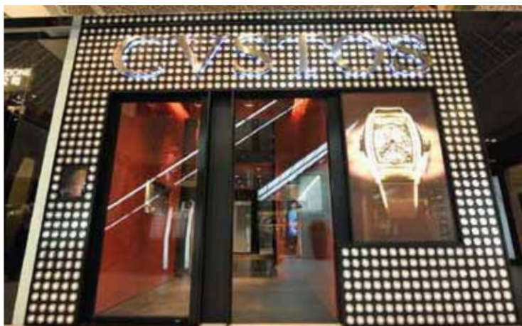
Design by Team HC; Boutique managed by Sincere Fine Watches