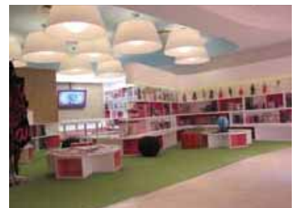
Barbie Shanghai Flagship Store, China^