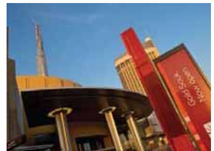
THE DUBAI MALL, UAE^