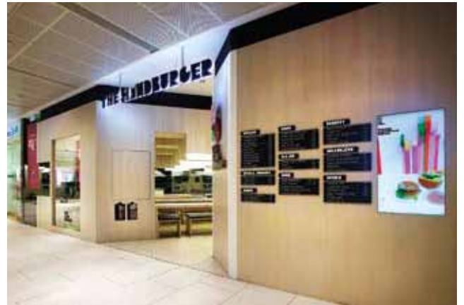
A fully-integrated retail development at Orchard with over 170 stores, Kingsmen supported leading brands like COTTON ON, ESPRIT, FOREVER 21, HVM, LACOSTE, UNIQLQ and a number of eateries.