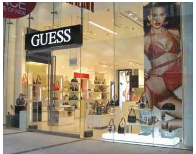
Orchard Road's tallest vertical mall, orchard central offers a unique retail experience for urban shoppers. Kingsmen worked with repeat clients for the design and/or construction of some specialty stores and eateries like Desigual, GUESS Accessories, THE HOUR GLASS and dessert haven, HEAVEN'S LOFT.