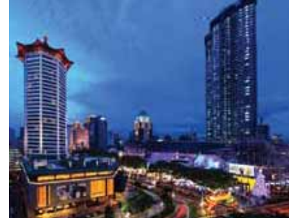
Re-making of Orchard Road, Singapore^