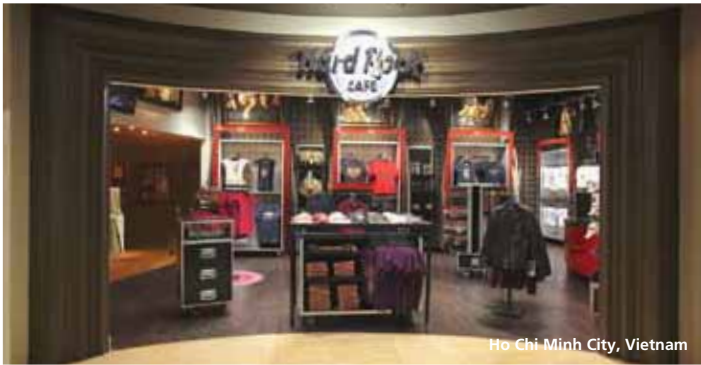
Ho Chi Minh City, Vietnam