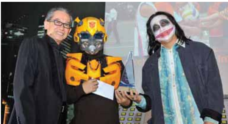
Team Award Design Studio & Interiors Division