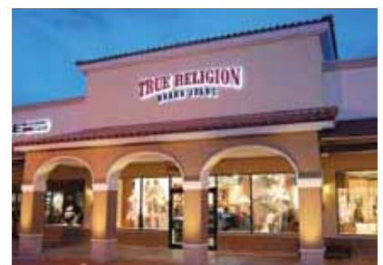
TRUE RELIGION BRAND JEANS, Japan^