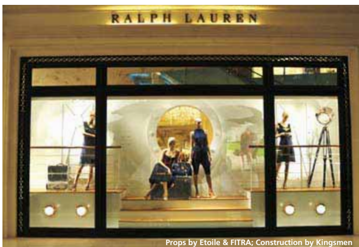
Props by Etoile & FITRA; Construction by Kingsmen