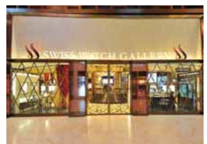
Luxury Fashion at RWS, Singapore^