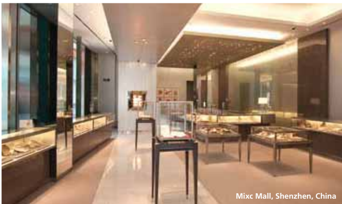
Mixc Mall, Shenzhen, China

Over the years, we have consistently extended our project management and fit out services to execute a luxurious shopping experience for Tiffany & Co. customers. Last year alone, Kingsmen successfully completed three stores in China and one in Hong Kong.