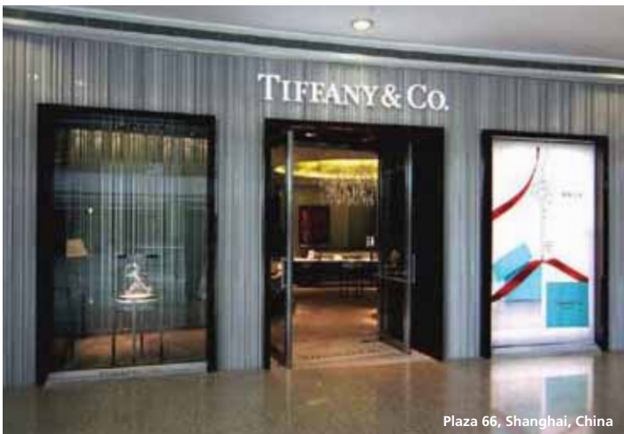
Plaza 66, Shanghai, China