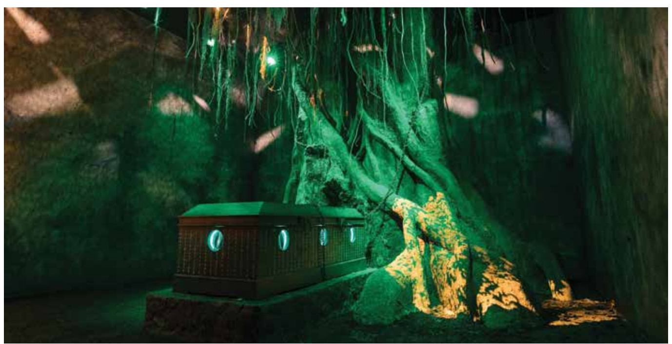
MADAME TUSSAUDS SHANGHAI CHINA

The wax museum combines leisure, entertainment, and adventure in its Royal Garden Zone for English tea party and the Lost Tomb Zone from the popular Chinese drama series. Elaborate show effects create an escape-game concept in 'Lost Tomb' while fanciful furnishings decorate