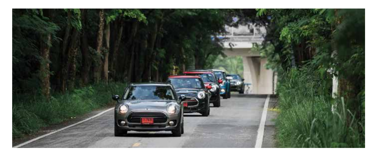
BMW MINI ROADSHOW 2018 AT PHUKET AND CHONBURI THAILAND

The party that never ends for Chang Beer's Urban Pulse 2.0 landed in Vietnam and then Hong Kong on its tour of urban cities around the globe. The event showcased the dedication that Asian craftsmen have contributed to the urban arts scene. Kicking off the event with hip-hop artistes globally, each venue brought dynamic one-of-akind experiences with interactive acts. The design was brought to live using neon wavy lines to create movement and an 'infinity' effect. In the upbeat rhythms, Chang Beer brought to life its philosophy of passion for excellence in the pursuit of perfection.