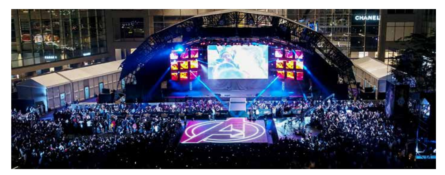
MARVEL STUDIOS' AVENGERS INFINITY WAR FAN EVENT SINGAPORE

Jointly organised by Disney and Marina Bay Sands, the highly anticipated red carpet event on 16<sup>th</sup> April 2018 gathered 4,000 fans at the main Event Plaza with over 3,000 watching the live streaming from the Sands Expo Hall. From the fan registration and the