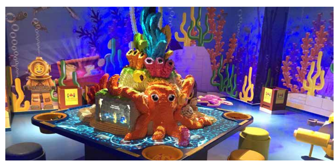
UNDERWATER QUEST AT LEGOLAND DISCOVERY CENTRE CHINA

The new addition of the Underwater Quest section at Shanghai's interactive play centre Legoland creates an otherworldly room for children and their families. Other than