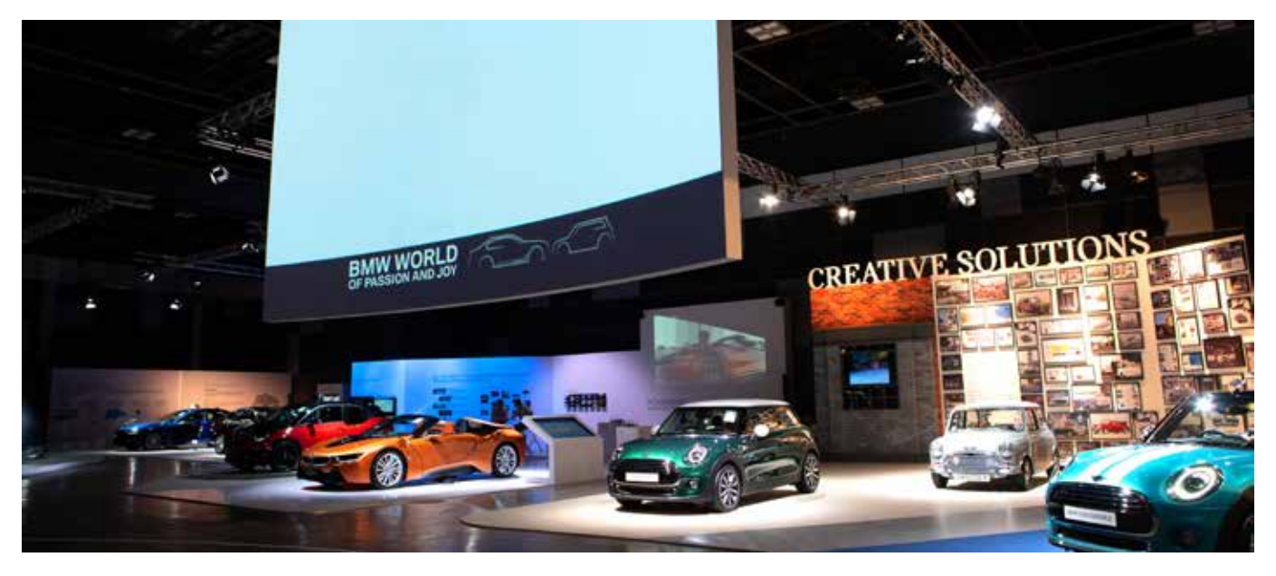
BMW WORLD - OF PASSION & JOY 2018 SINGAPORE

were reused and recycled from previous exhibition with no additional construction involved. Held annually, the event continue to impress customers as BMW moves towards conscious awareness in their design and service choices.