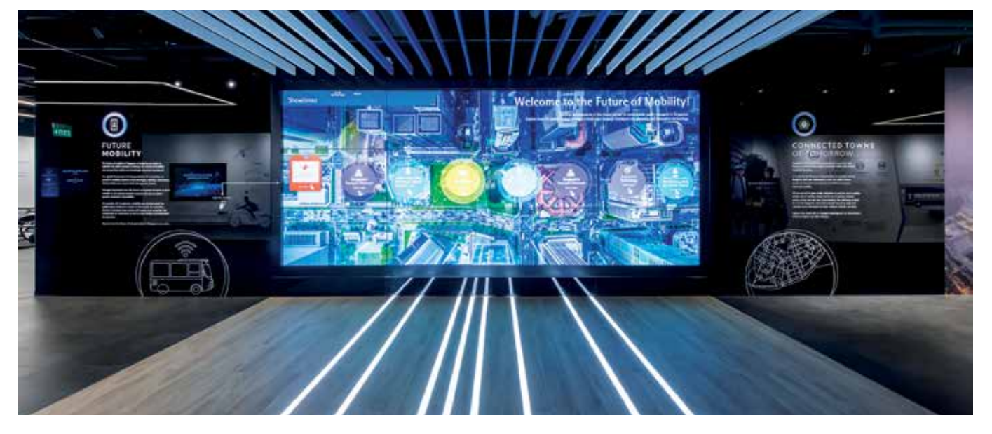
LTA SINGAPORE MOBILITY GALLERY SINGAPORE

the Data center, Space of Tencent Cloud, and Digital China were concocted to stimulate the advanced development of digital intelligence of the group. Using large, mutiple screens fitted to arcs and sliding doors, holographic projections, and stunning mirror ceilings, the breathtaking visual experience is equally remarkable for visitors.