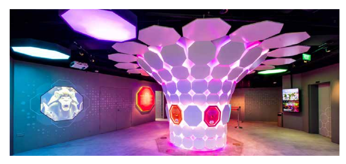
SENTOSA MERLION ATTRACTION SINGAPORE

The iconic Merlion attraction on Sentosa island reopened to welcome visitors with a brand new, fresh and exciting experience. Fitted with augmented and virtual reality elements, the attraction features new content and multiple photo opportunities to create a sophisticated and engaging space