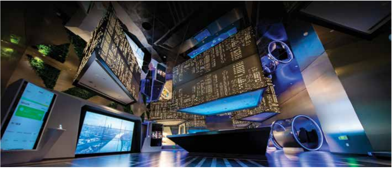
TENCENT BINHAI EXPERIENCE CENTRE CHINA

research of 'smart home' concept, the showroom located in Nanning made use of immersive multimedia projection to visualise their dedicated efforts in developing intelligent homes on a global level.