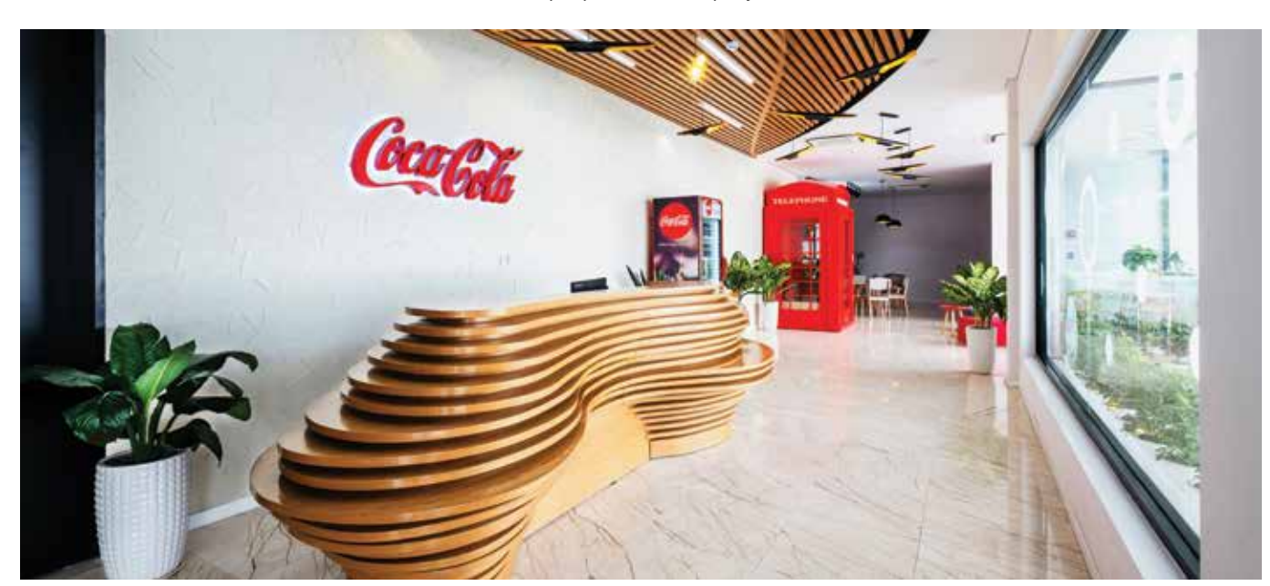
COCA-COLA BEVERAGES CORPORATE OFFICE VIETNAM

Designed to infuse a sense of warmth and hospitality amidst modern aesthetics, the space blends local cultural elements with modern finishes. Harmonizing intimate communal corners with collaborative spaces, the centre demonstrates the versatility of the reinvented architecture.