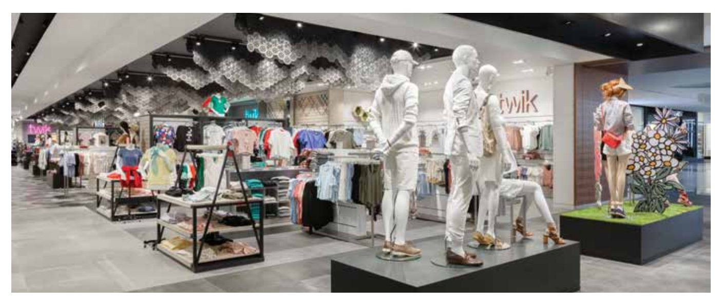
LA MAISON SIMONS, GALERIES DE LA CAPITALE CANADA

The large-format fashion retailer La Maison Simons underwent a major overhaul of its Galeries de la Capitale store in Quebec City to a swanking new 79,600 sqft space. The space's design and construction looks to details by artists to reflect personality reduce carbon footprint and create unique and awareness in each corner of the retail spaces. The entire second floor is meticulously remodelled project. designed to generate as much energy as