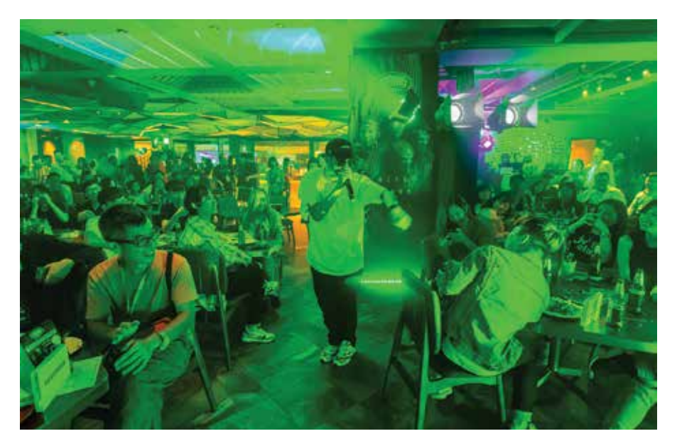
CHANG BEER URBAN PULSE 2.0