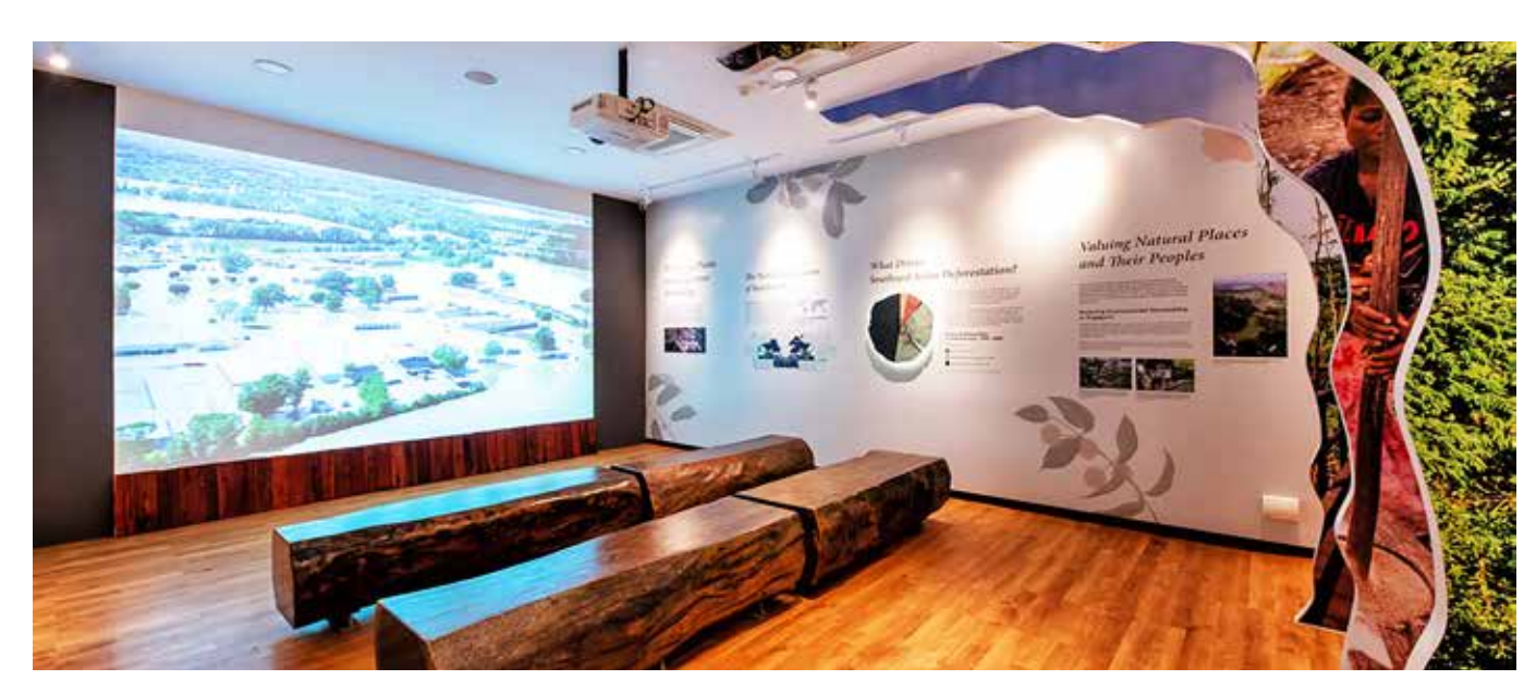
CENTRE FOR ETHNOBOTANY IN SINGAPORE BOTANIC GARDENS SINGAPORE

delightful sea creatures made from lego bricks, the attraction arena is animated by live technology and a digitally activated build table to keep the kids entertained for hours.