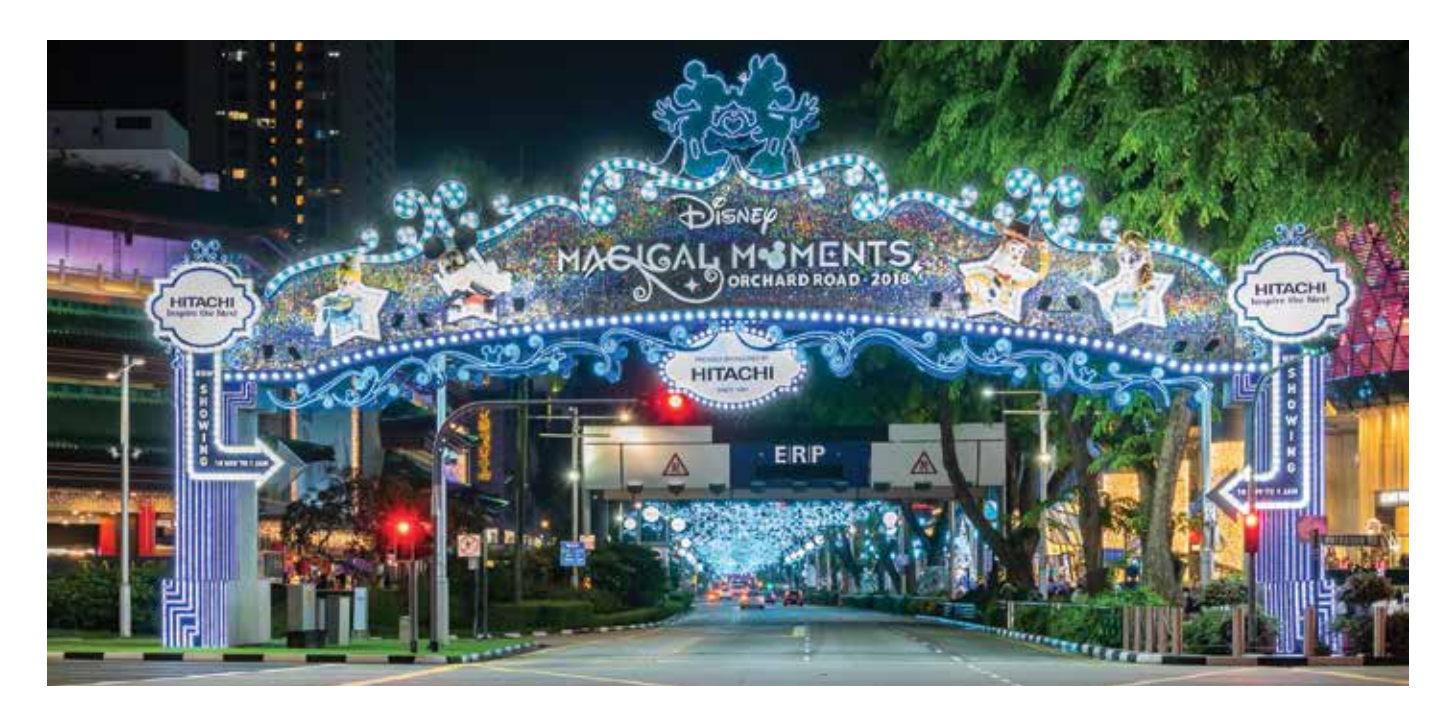
CHRISTMAS DECORATIONS 2018 AT ORCHARD ROAD SINGAPORE

superheroes' arrival, to a spectacular laser projection and pyrotechnics display, this exceptional event showcased Kingsmen's ability to manage and execute a live regional event, creating a memorable experience for fans and celebrities alike.